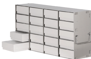
EcoAlu, 50 mm box