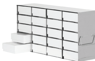
Standard, 50 mm box